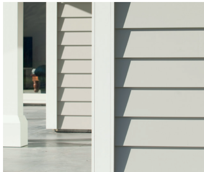
A-align Bevelback Cladding

Available in three profiles: Bevelback, Rusticated & Vertical.