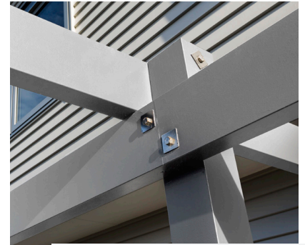
Tru-Pine Posts, Beams & Boards

A-align doubled sided Fencing uses precision-machined solid timber components, treated and engineered for performance. The fence is easily constructed with a user-friendly fixing system.