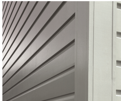
A-align Rusticated Cladding

The traditional weatherboard look, with each board overlapping the board below it. Available in two profile depths. 187mm x 18mm (Ex. 200 x 25) and 142mm x 18mm (Ex. 150 x 25). Available in Concealed Fix and Nail Fix.