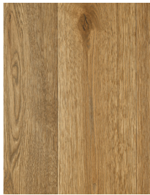
Stony Bay 21