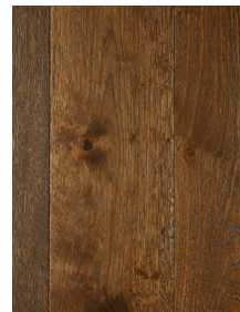
Kauri Cliffs 20