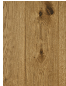
Tara Iti 16