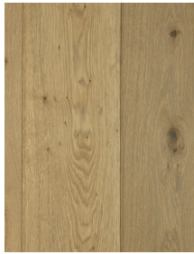
Mt Difficulty 06