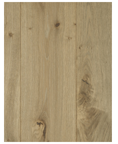
Tasman Glacier 10