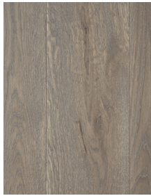
Mt Ruapehu 22