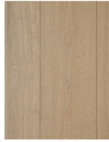
Fairy Falls 24