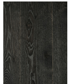
Iron Sands 14

Disclaimer: The information given here is correct at the date of publication however due to Bespoke Timber's commitment to ongoing product improvement, Bespoke Timber reserves the right to modify this information without prior notice. Please note that Bespoke Timber's instructions regarding installation, cleaning and maintenance must be observed. Please refer to jacobsen.co.nz for guidance. Whilst we have made every effort to ensure the colours and wood characteristics displayed are as accurate as possible these images may vary from the actual product.