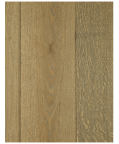
Te Paki Sands 07