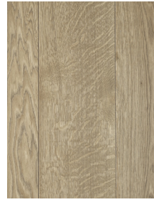
Abel Tasman 04