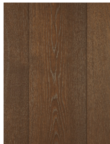
Ka Pai 15