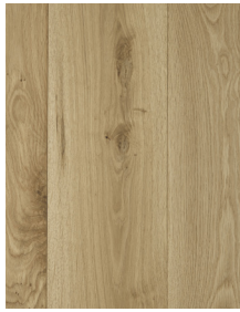
Golden Bay 05