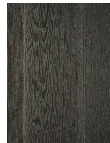
Lion Rock 13