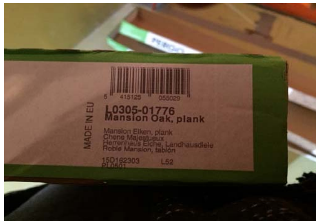
Figure 2: Packaging for floor boards