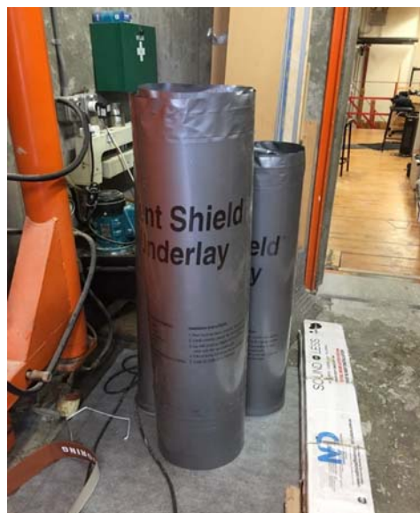
Figure 3: Packaging for Silent Shield Underlay