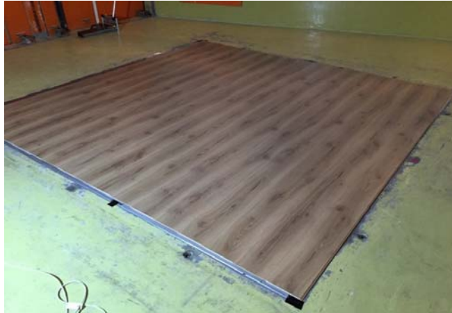
Figure 1: Boards in place on underlay.