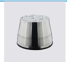
SkyVault series amplifier