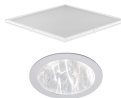
Round or square