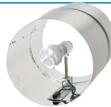
LED light kit