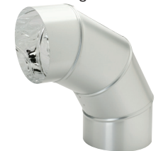
0-90 degree bend