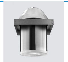
Open and closed ceiling configurations