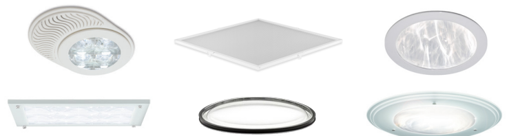
A variety of additional lenses, diffusers, square options and thermal panel