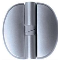
Concealed fix Avanti emergency lift off gravity hinge