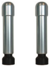
Adjustable anodised aluminium pedestal legs

Board: 18mm Laminex Structuralboard Colour: Stipple Seal Hardware: Satin Chrome Finish