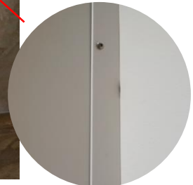
Continuous wall channels to all junctions