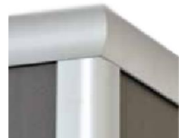
Anodised aluminium slimline headrail corner detail