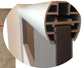
Anodised aluminium slimline headrail infill detail