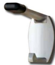
Concealed fix Wave coat hook