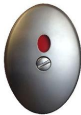
Concealed fix Avanti Indicator