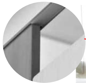
Anodised aluminium slimline headrail with snap headrail inserts