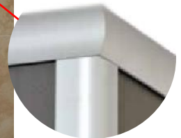
Anodised aluminium slimline headrail corner detail