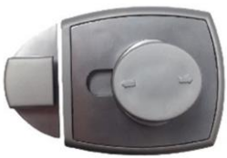
Concealed fix Wave lock with bumper