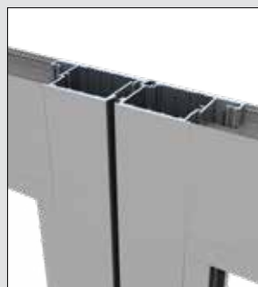
French door meeting stiles.