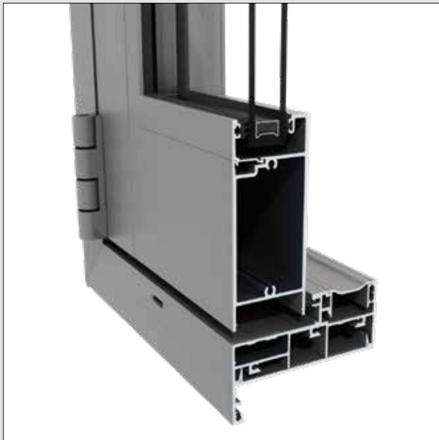
Hinged door frame (106mm) – open-out.