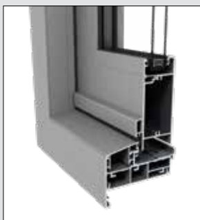
Open-in door with weather bar on door rail.