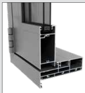
Hinged door frame (158mm) – open-out.