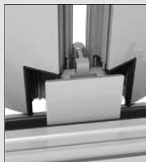
Bi-fold hinge roller with free swinging panel.