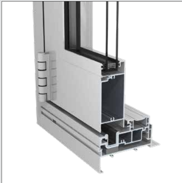
Sill frame and panel section.