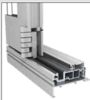
Bi-fold sill and roller.