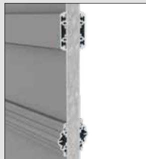
Classic door moulding/ bead options.