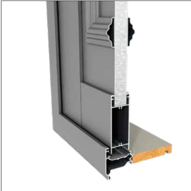
Classic door frame and section.