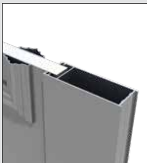
Classic door stile (non-thermal option).