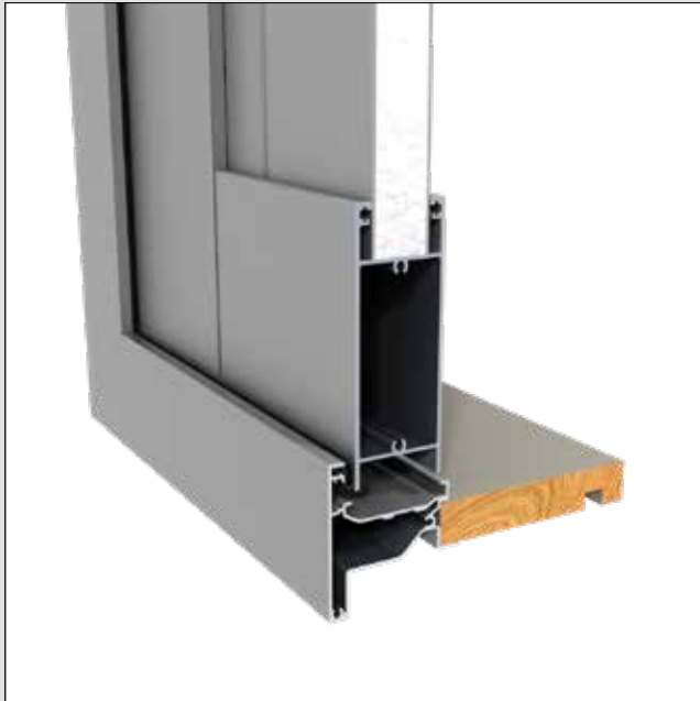
Door frame and Latitude bottom rail (thermally broken option).