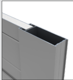
Standard Latitude door stile.