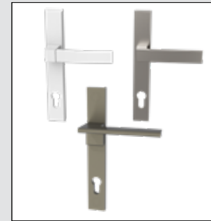
Urbo, Icon and Elemental lever handles.