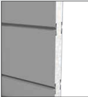
Latitude tongue and groove joints.