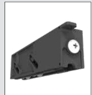
The sliding door roller is rated to 150kg so panels of 300kg can be carried.