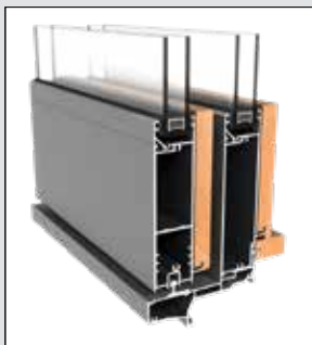
Sliding door rail with sightline adaptor behind.