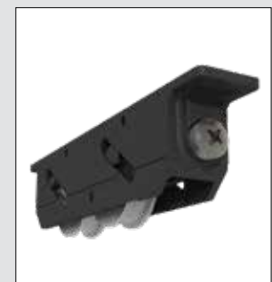
The sliding window roller is rated to 100kg so windows of 200kg can be carried.