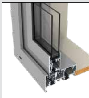
Sliding window sill and jamb (single slider).