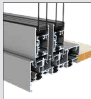
Multi slider window track and panel rails.