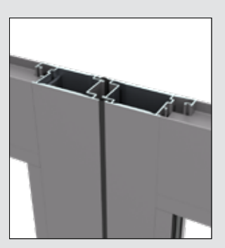
French door meeting stiles.