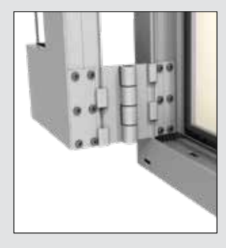
Parliament hinge for full opening.