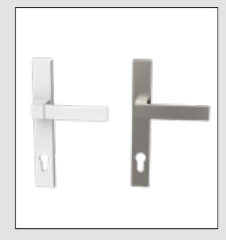
Urbo and Icon Lever handles.