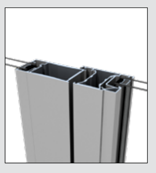
Hinged door and sidelight on right (standard mullion).