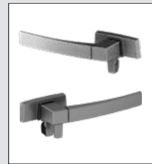
Urbo window fastener and venting option.