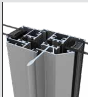
Heavy duty mullion option (right) and sash.