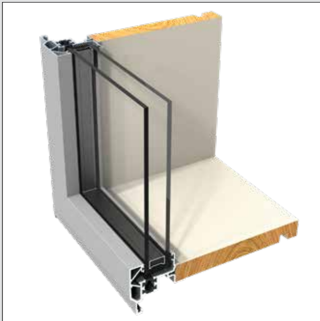
Standard frame and sash.