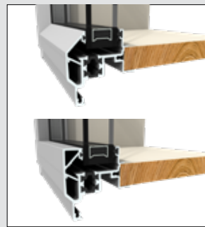
Sloped and square bead options.