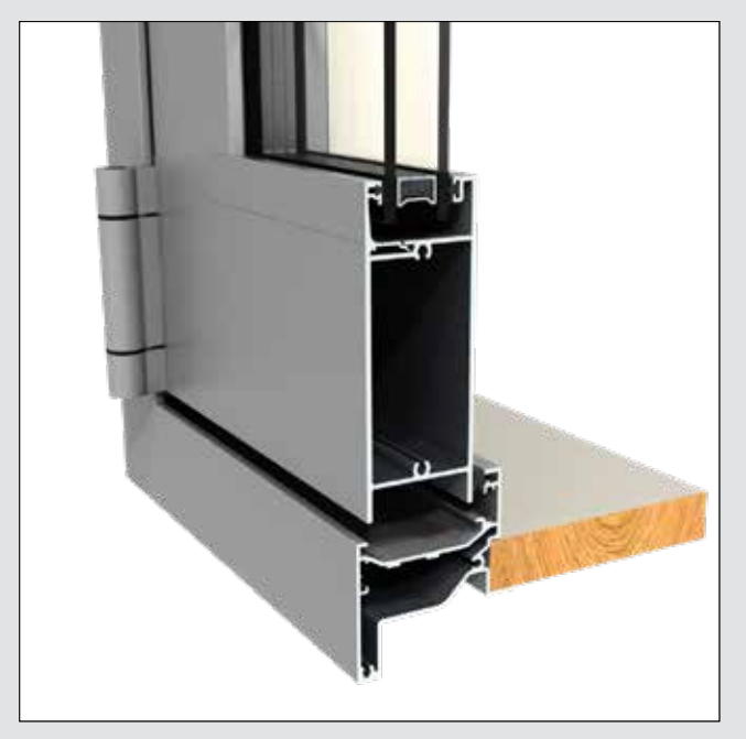
Hinged door frame and section.