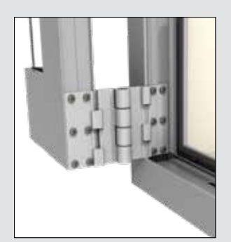
Parliament hinge for full opening.