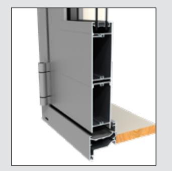
Bottom rail extender.