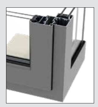
Opening sash (left) on side of greenhouse or box window.