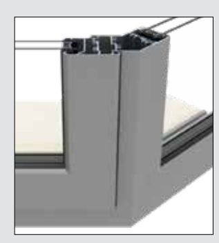
135° corner detail with opening sash (left).