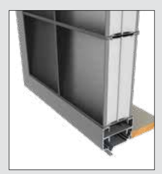
Glass block frame with block above and vertical separation bar shown.