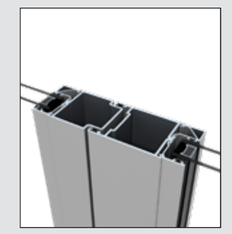
Sliding door 50mm meeting stiles.