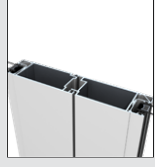
French door meeting stiles.