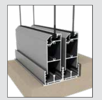
Magnum multi slider sill.