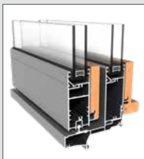
Slider with sightline adaptor at back.