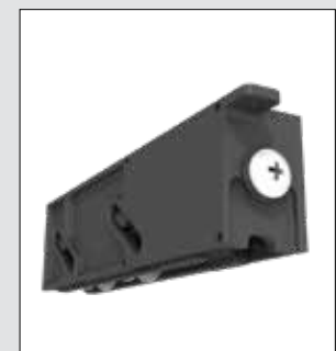
The sliding window roller is rated to 150kg so windows of 300kg can be carried.