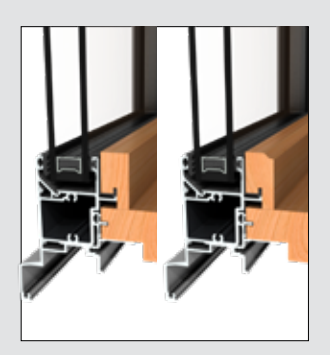
Timber profiles available square edge and profiled.