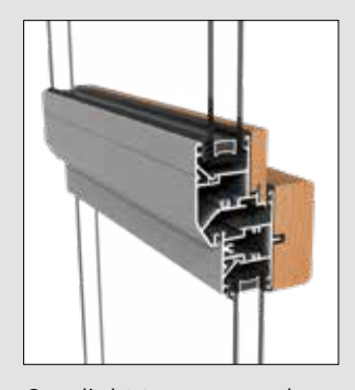
Overlight transom and sash above.