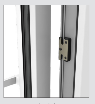
Casement lock keeper on window jamb.