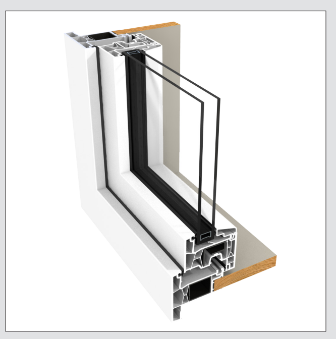
Tilt and turn frame and sash.