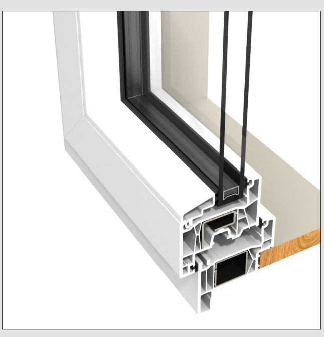
Standard window frame with awning sash.