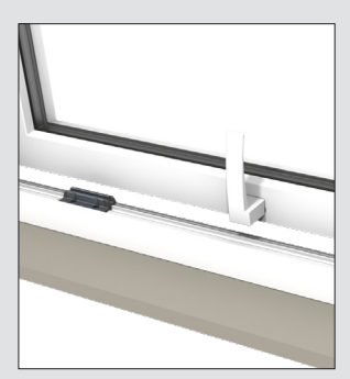
Urbo hardware on sash.