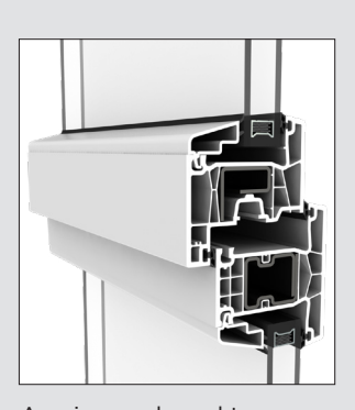
Awning sash and transom - exterior view.