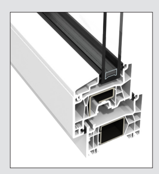
Chair frame and sash.