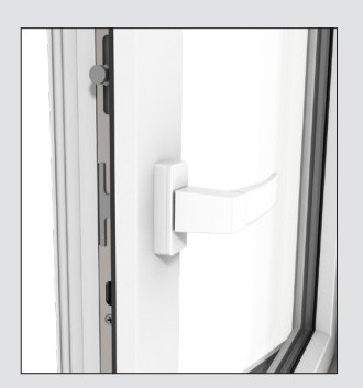
Multi-point locking available with Urbo hardware.