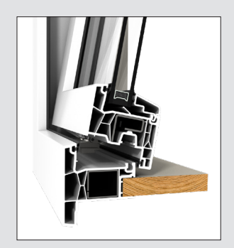
Opening sash in hopper window mode.