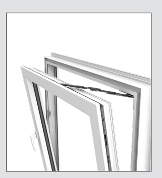
Inward opening sashhopper window mode.