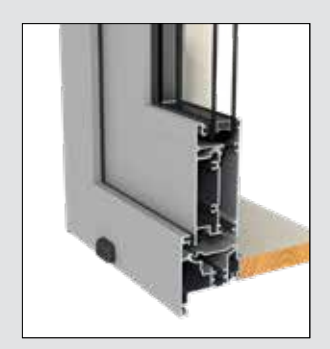
Hinged door frame open-in.