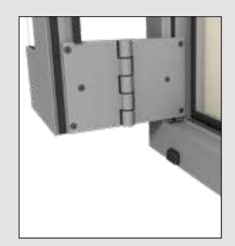
Parliament hinge in open position.