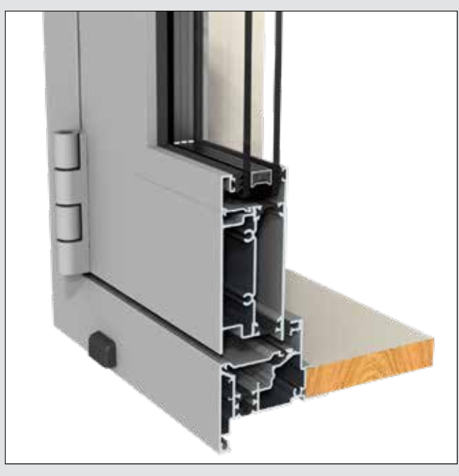
Hinged door frame - open-out (drainage cap shown).