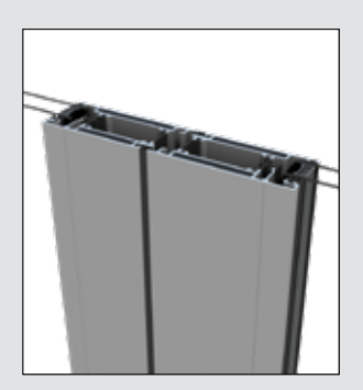
French door meeting stiles.