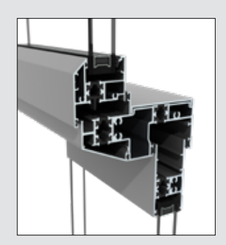
Sliding door overlight transom - awning sash shown above.