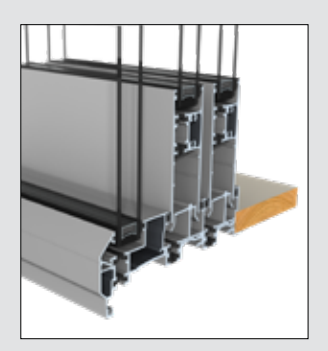
Double slider sill.