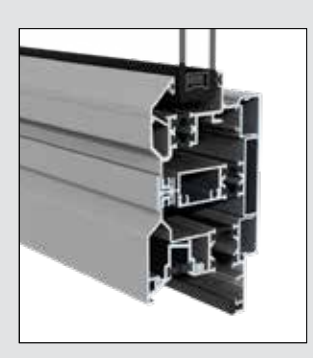
Bi-fold head section and fixed light above.