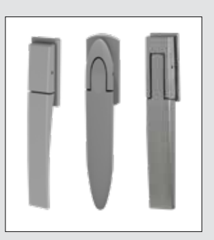
Urbo, Miro and Icon bi-fold handles.