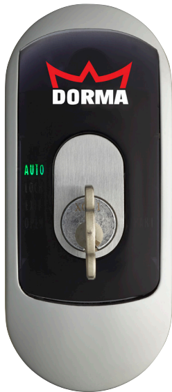
PK4 AUTO Mode