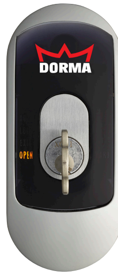
PK4 OPEN Mode