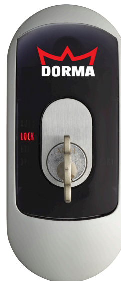
PK4 LOCK Mode