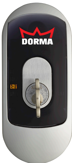
PK4 EXIT Mode