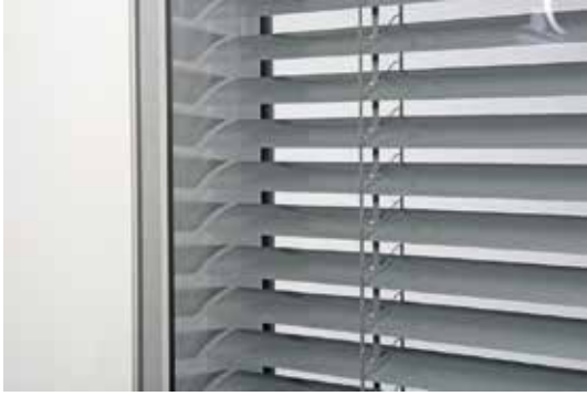
Electrically controlled blinds (Optional)