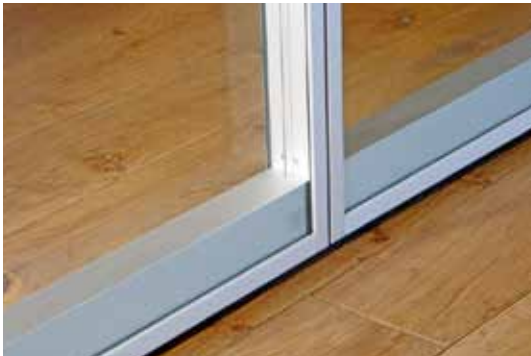
Minimal frame surround (30mm)