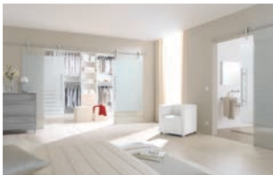
Sliding door system 14–21