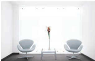
Connecting system for glass elements 22–25