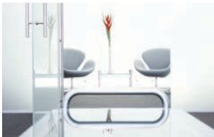
Pivoting door system 8–13