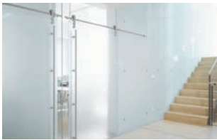
Connecting glass and stainless steel 4–7