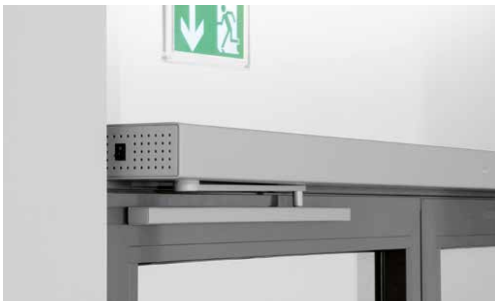
Professional: Seamless cover with a projection height of just 70 mm, especially suitable for narrow-stile doors.

The mechanical door coordinator ED ESR for double-leaf doors is maintenance-free and ensures that rebated doors close in the correct order. In addition, all components are concealed behind a cover of the DORMA Contur design with a height of only 70 mm.