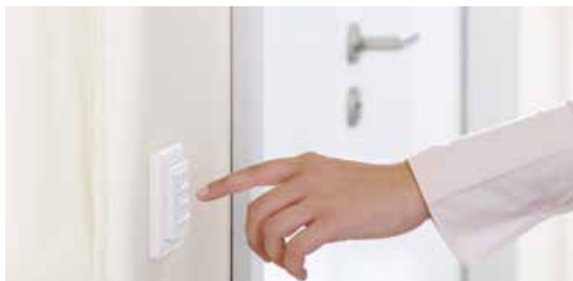
Easy handling via DORMA BRC radio system.