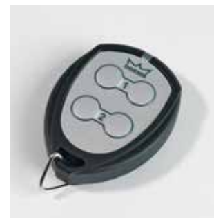
Reliable access control via keypad.

Standards, regulations, availability dates as well as available functions for the operators and modules may vary from country to country. The required and available equipment may thus differ from the examples shown and indicated in this brochure.