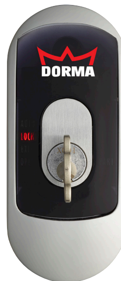
PK4 LOCK Mode