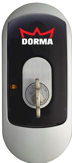
PK4 EXIT Mode