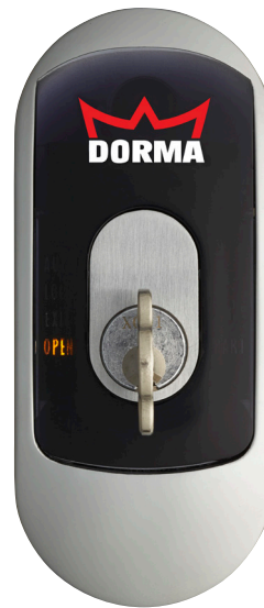
PK4 OPEN Mode