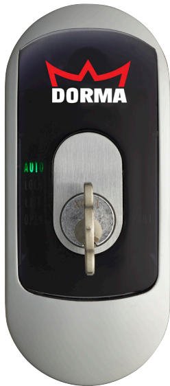
PK4 AUTO Mode