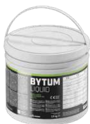
BYTUM LIQUID page 50