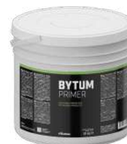
BYTUM PRIMER page 53