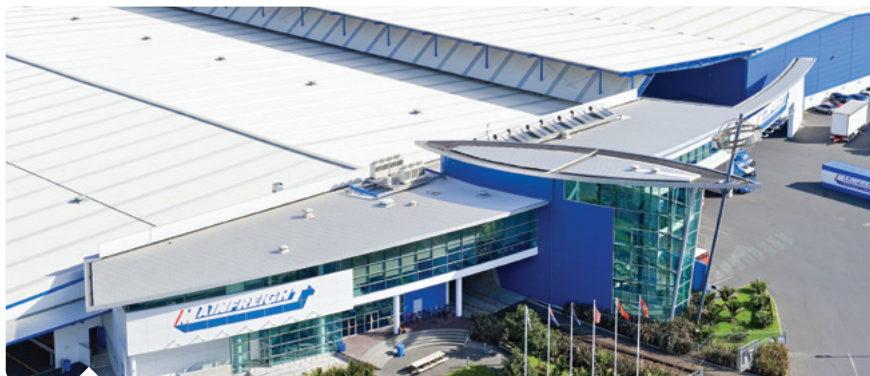
TOPGLASS® COLOUR: OPAL PROFILE: MAXISPAN® 2400 G/M 2

*Refer to the Alsynite Technical catalogue for full warranty information.