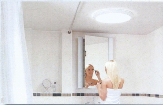
One ceiling fixture for Daylighting, Ventilation & Electric Lights.

The Power Kit can be controlled by the MARCS remote system.