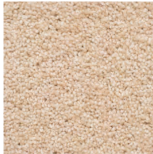
25 / DAHLIA