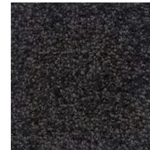
67 / PARASOL