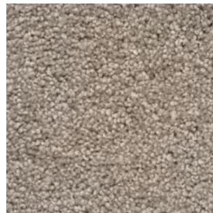
167 / POURVILLE