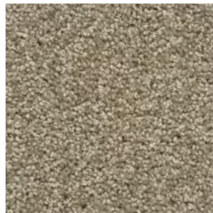
33 / IRIS