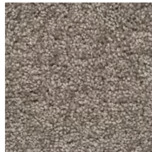
147 / SAN GIORGIO