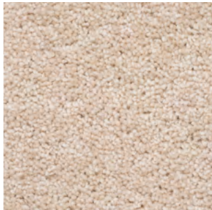
82 / REGATTA

*Exclusions, prorating and terms and conditions apply.