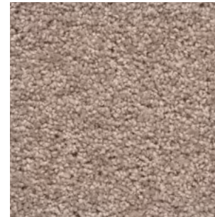
4 / WATER LILY