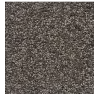
157 / IMPRESSION