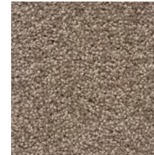
74 / GIVERNY