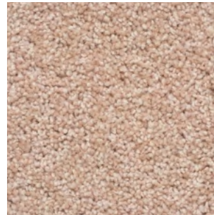
12 / CAMILLE