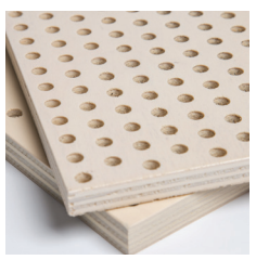
Décortech Firesafe Décorply Plywood is available in a range of stylish finishes and perforations.