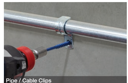
Pipe / Cable Clips