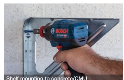
Shelf mounting to concrete/CMU