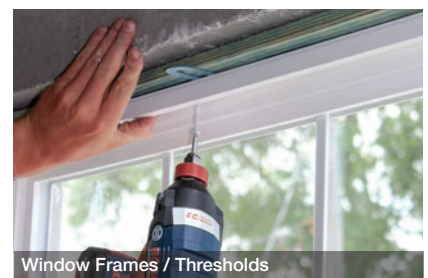
Window Frames / Thresholds