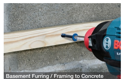
Basement Furring / Framing to Concrete