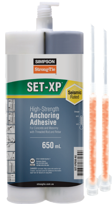
SET-XP650-AU (650 ml) (Includes 2 mixing nozzle EMN22)

*Let anchor fully cure without disturbing.