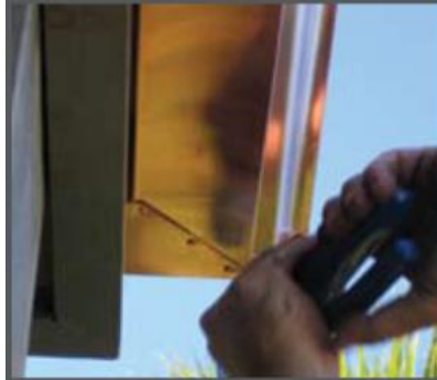
Colour matching rivets

https://continuous.co.nz/spouting-fascia-downpipe-services/installation