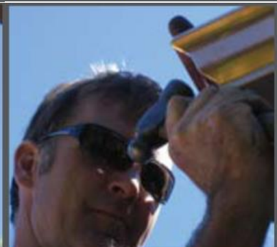
Tapped around by hand