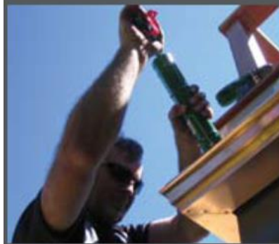
Application of silicon