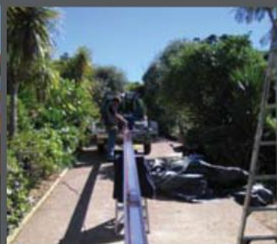
One continuous length