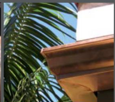
A beautifully mitred corner