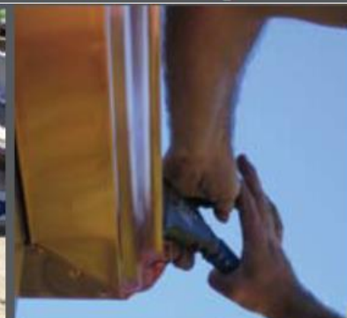
Trimming the metal