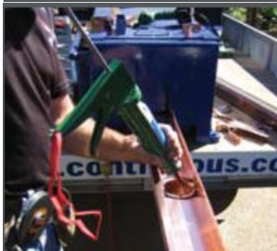
Fitting of downpipe dropper