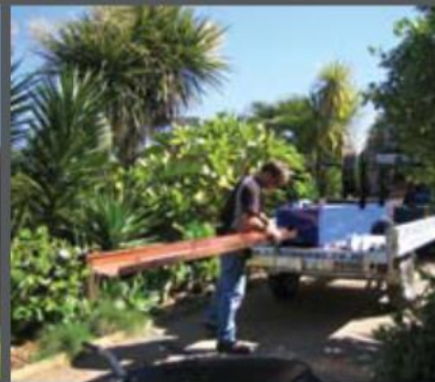
Lengths run out on site