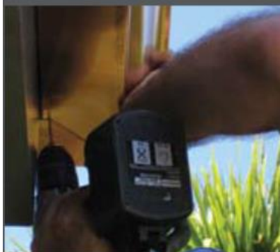
Fixing then riveting the corner