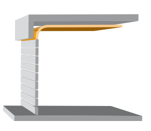
The low-header design guarantees greatest safety for people and vehicles, for example in underground garages and parking centres!

All models ensure the highest level of safety for people and vehicles!