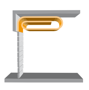
Oval spirals are space-saving shapes to be used in cases of structural limitations.