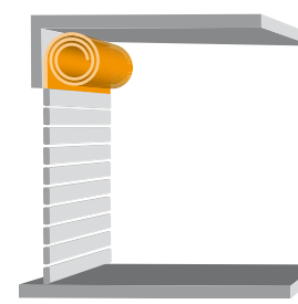
New: The EFA-SST® PS features a spiral construction that significantly reduces the space requirements in the lintel.