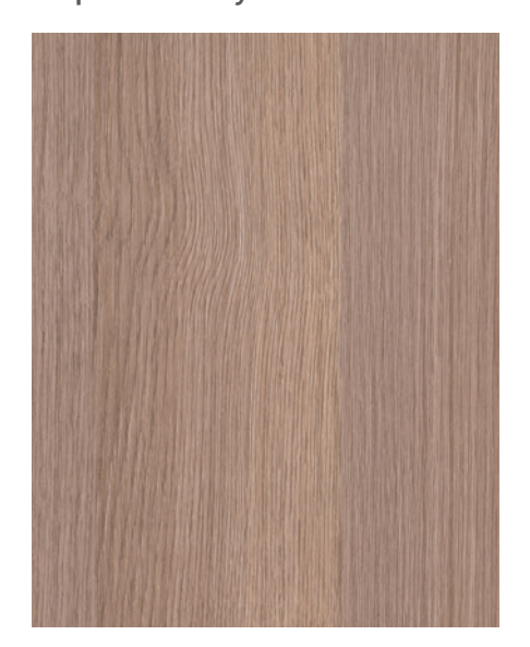
Mountain Oak - Free Form Panel