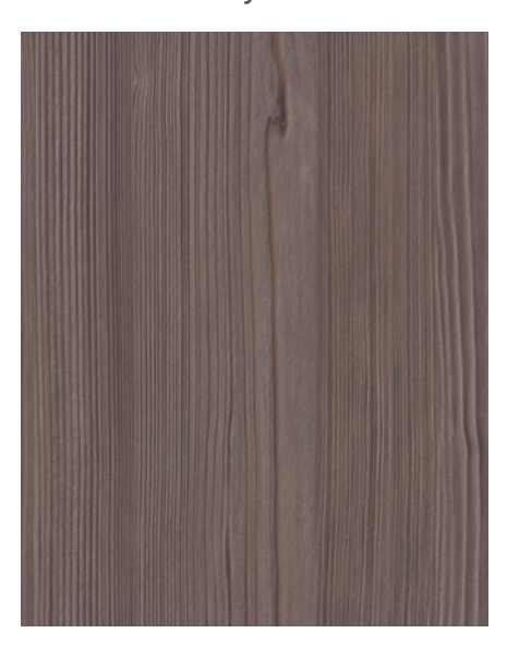
Vintage Elm – Free Form Panel