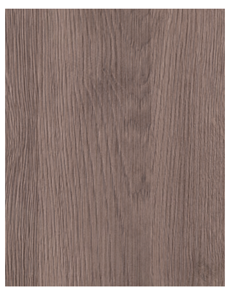
Vintage Oak - Free Form Panel