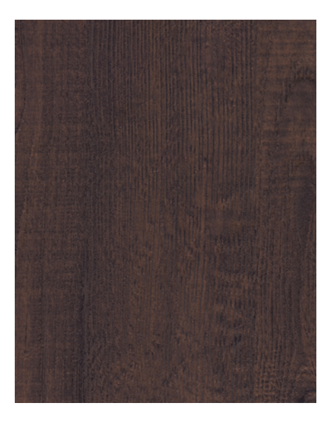
Scorched Ash - Synchronized Panel