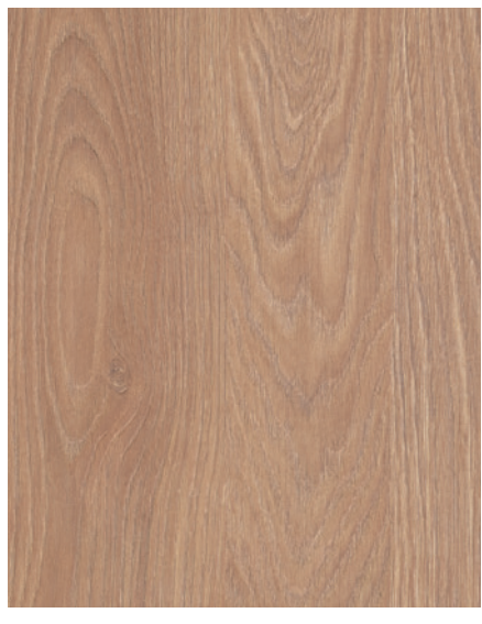
Coastal Oak - Synchronized Panel