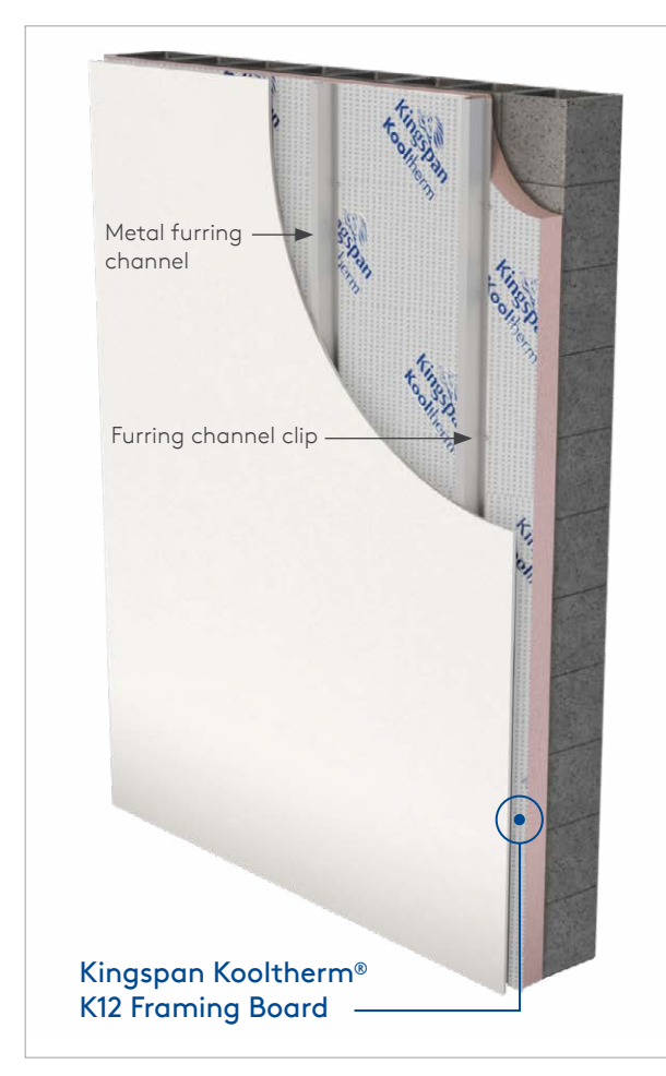
Figure 2. Block Wall Installation (Clip/Channel System)