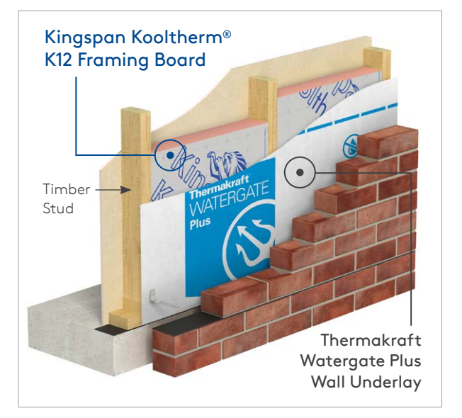
Figure 4. Timber Frame Construction with Insulation between Studs.

Wall system is based on 90 mm thick timber @ 30% framing, R1.8 bulk insulation, 10 mm plasterboard, Watergate Plus wall underlay, Kooltherm in various listed thicknesses, 45 mm cavity and 19 mm wooden weatherboard.