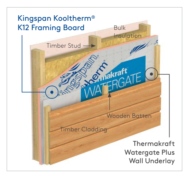
Figure 3. Timber Frame External Insulation Construction