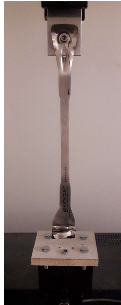
Horizontal panel mounting