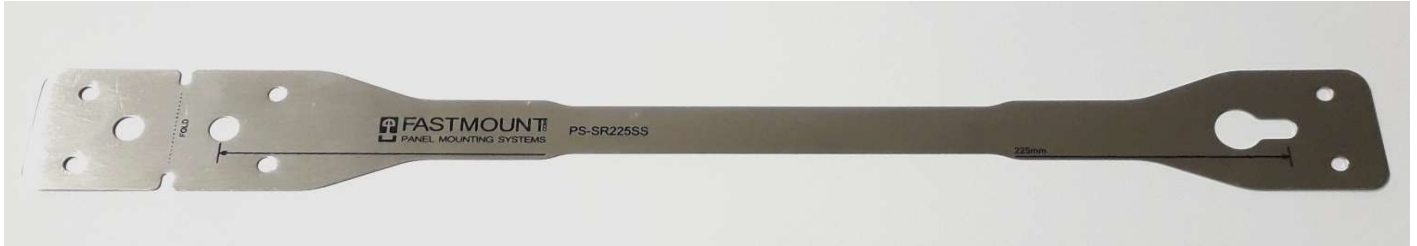
Figure 1 - PC-SR225SS strap