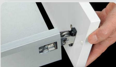
Front panel assembly