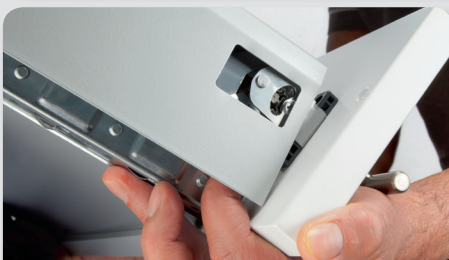
Front panel disassembly