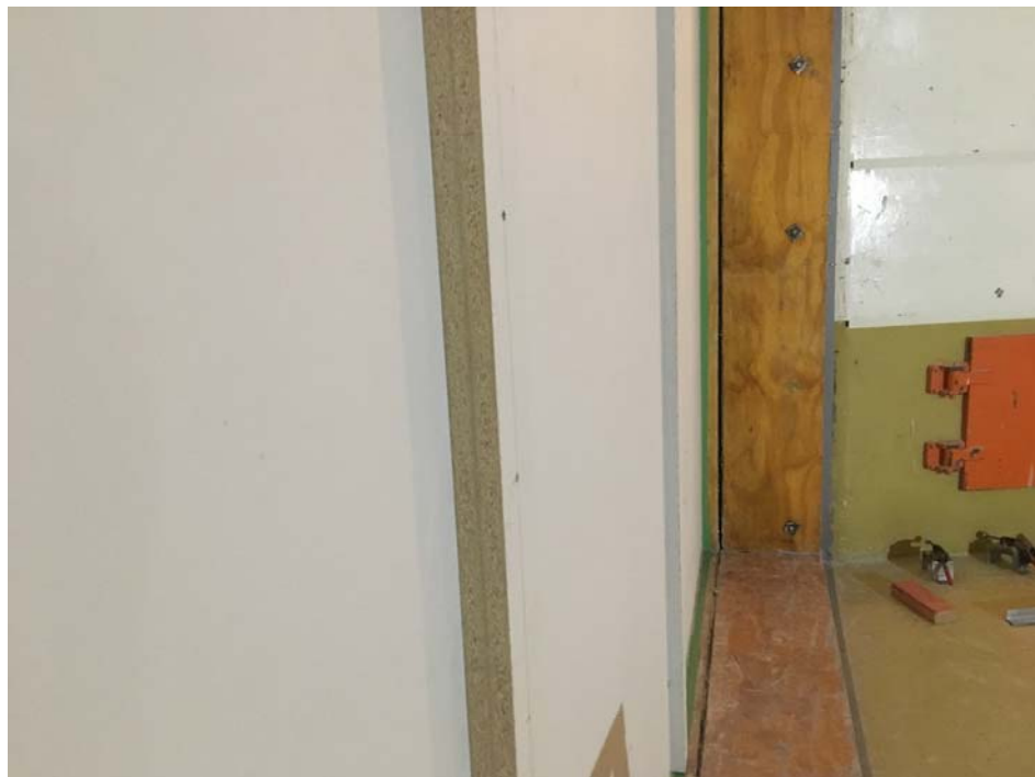
Figure 2: T1715 wall construction detail