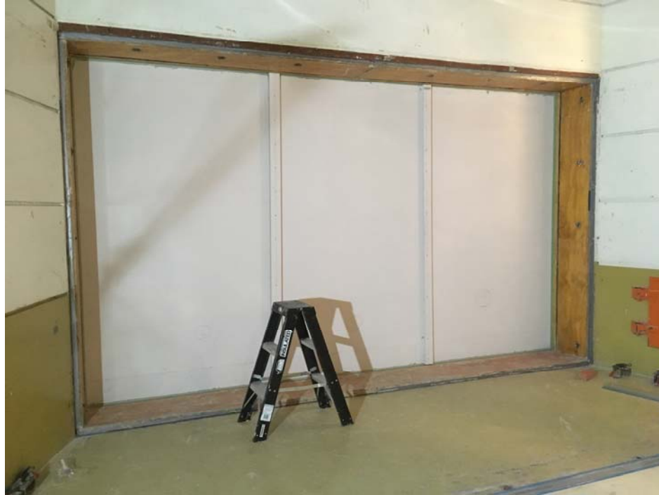
Figure 1: T1715 wall construction surface view