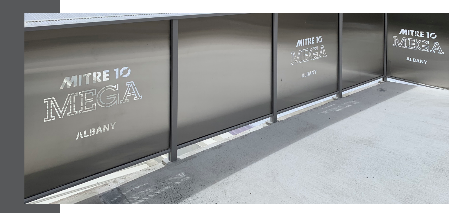
Clearspan Ali Sheet