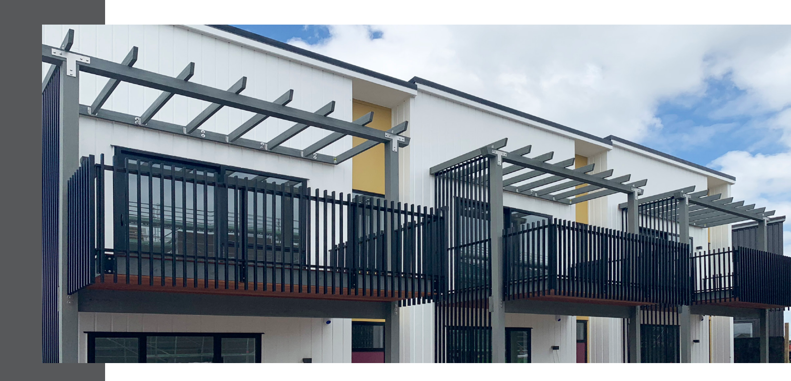
Clearspan Face Hung Fin