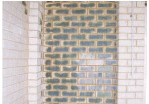
Vanadium stain not removed prior to hydrochloric acid application