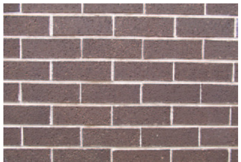
Damage to bricks caused by incorrect use of high pressure water jet cleaning