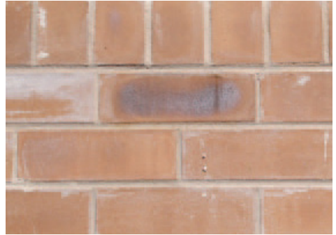
Signs of manganese staining