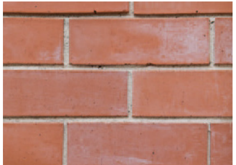
Typical calcium stain from wet sponging mortar joints