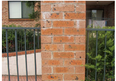
Acid burn on face brick work

Pre-wetting and frequent washing off is designed to prevent undue penetration of the acid into the brick and mortar where further reactions and staining often occur. Window sills and corners require particular attention with pre-wetting as the water readily runs off instead of being absorbed.