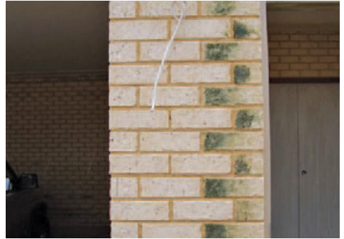
Vanadium as a green stain on light coloured bricks

After the initial removal of vanadium stains, more water on the masonry – even that used in the cleaning process – may induce further efflorescing of the salts to the surface, depending on the amount within the brick.