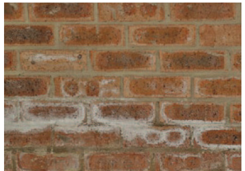
Efflorescence from ground salts