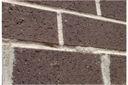
Damage to ironed mortar joint