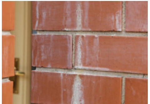
Calcium stains leaching from adjacent concrete balcony