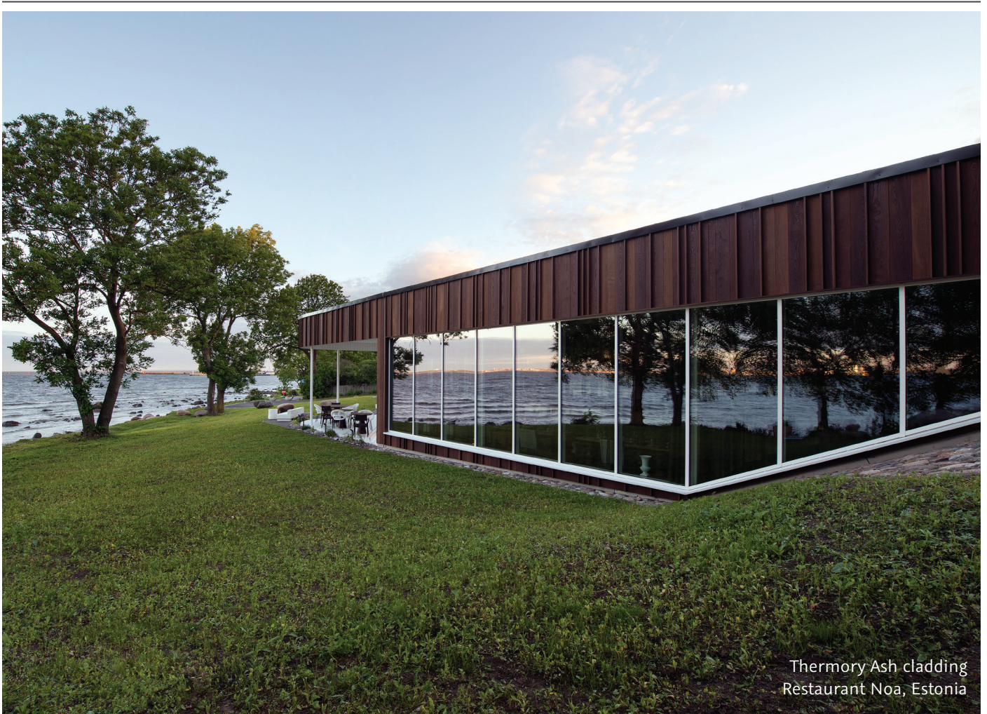
Thermory Ash cladding Restaurant Noa, Estonia

Thermory AS procures White Ash from North America and Europe, from regions that take care of the forest responsibly and sustainably.