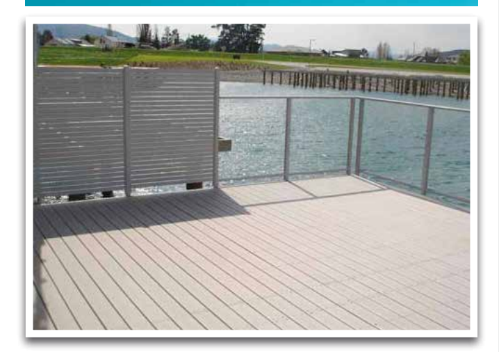
Quality Privacy Screening that looks great and is built to last.

Quality New Zealand designed and produced. Provista Euro Slat Screening has been designed to compliment your property while ensuring safety for you and your family.