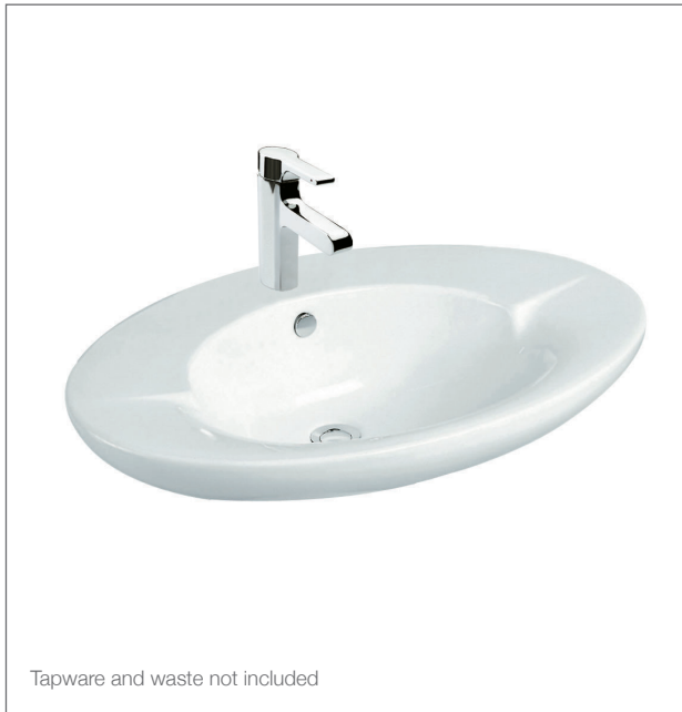
Tapware and waste not included