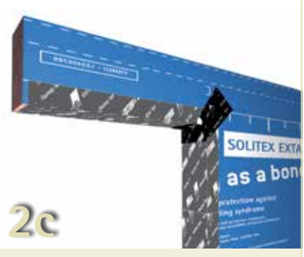
Cut and apply a small strip 100 mm x 150 mm to reinforce the corner.