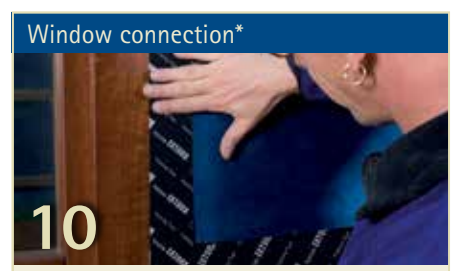
Seal the wall protection membranes to the joinery using the TESCON EXTORA tape to ensure the connection is windproof and weathertight.

To create weathertight joints between wall protection membranes and smooth, non-mineral surfaces such as wood-based panels or planed wood, place TESCON EXTORA centrally over the joint, unroll and stick down over the joint.