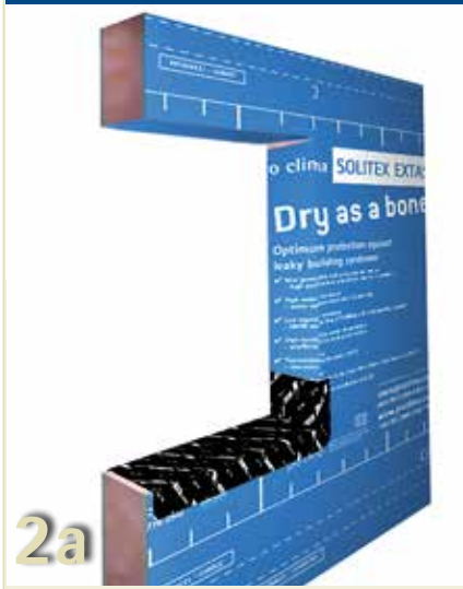
Fit flexible flashing tape (e. g. TESCON EXTOSEAL) to sill.